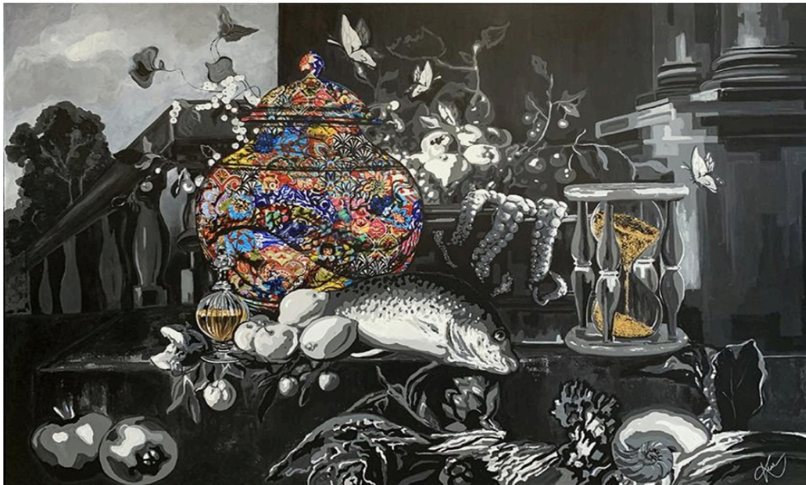
"Feast Of Life" - 150x100cm