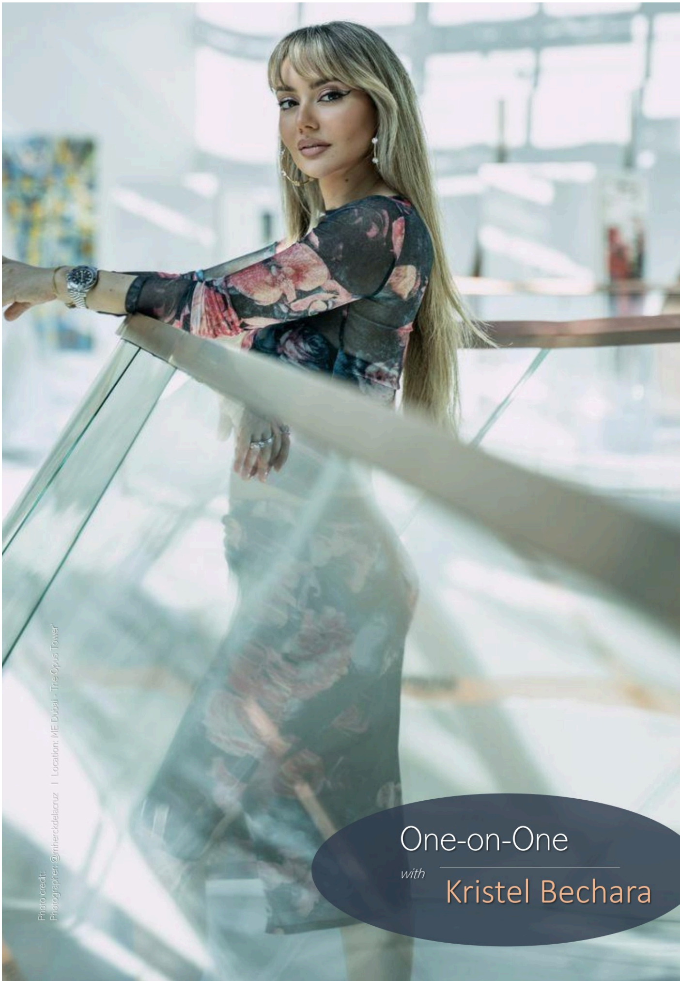
Location: ME Dubai - The Opus Tower