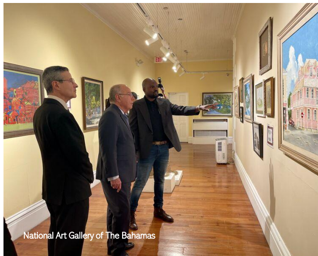
National Art Gallery of The Bahamas