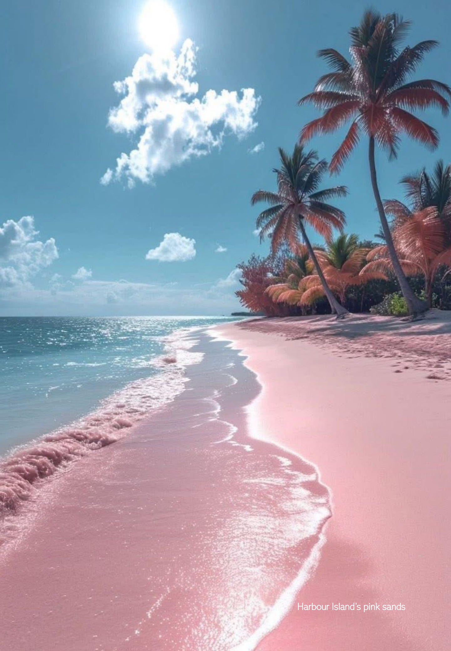
Harbour Island's pink sands