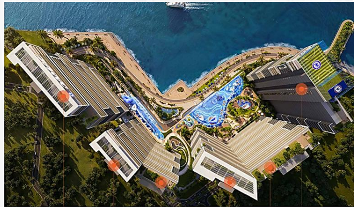
TOWER D 25 / 28 / 30 / 33 TOWER B 25 / 28 / 30 / 33 TOWER A 25 / 28 / 30 / 33 TOWER A 25 / 28 / 30 / 33 TOWER B 25 / 28 / 30 / 33 TOWER C 25 / 28 / 30 / 33 CHELSEA RESIDENCES 1 CHELSEA RESIDENCES 2

The six towers of Chelsea Residences by DAMAC are a contemporary, urban reflection of coral reefs, conceptualised to echo the lush vibrancy of underwater life and the very spirit of its eponymous football club.